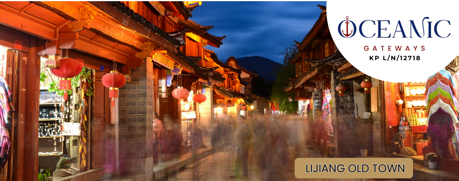
LIJIANG OLD TOWN